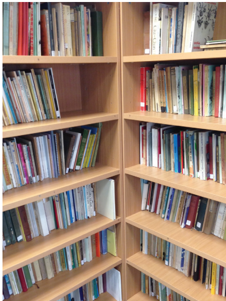
Plenty more books are looking for homes. Keep an eye out for them online.

Our conference in Sheffield went very well and it was lovely to see so many faces, including some returning after a few years away. It was a smaller event than usual, probably because it coincided with Easter, although this helped to make it cosier. Many people commented to me how nice the venue was, especially with the novelty of having refreshments freely available. And people were certainly pleased to have books available - I sold 93 second-hand ones over the course of that one weekend!