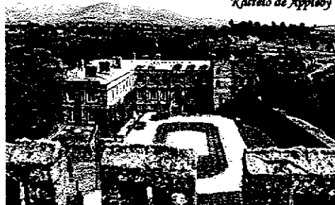
Castello de Appleby

An excellent programme is planned and the theme is RAILWAYS with an excursion on